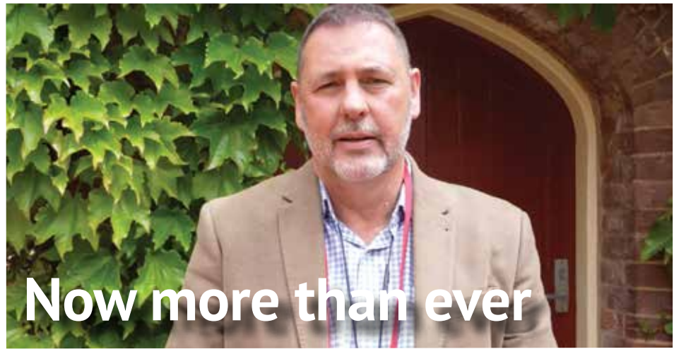
The following article was first published by Tearfund (www.tearfund.org.au) and is reprinted with kind permission.